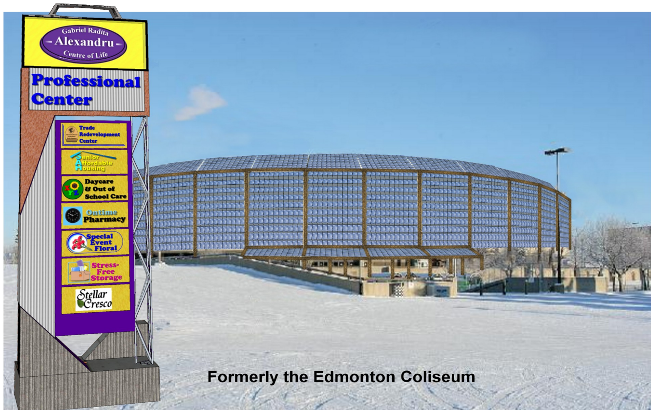
Figure 1: South view of the Edmonton Coliseum covered with solar panels

Welcome to the “Alexandru Radita Centre of Life”. This is the operating name for the non-profit organization “12937212 Canada Centre” currently registered with Not-For-Profit Corporations Canada.