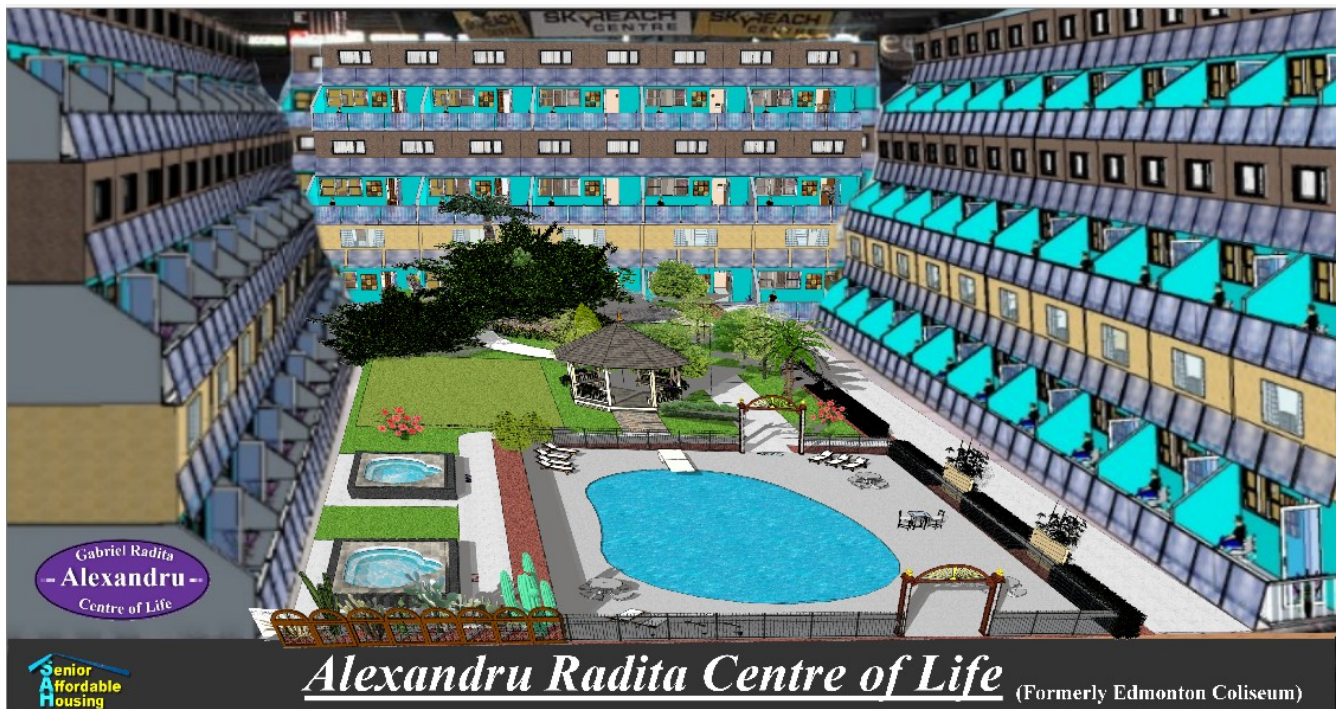
Figure 2: Inside view of the old ice area with stacked suited manufactured in the school

Lets face it, technology can be the enemy of labor force if we don't take into account that replacing 5 people's jobs with machinery, what will those 5 people now do? Difficult question!! This is one of the purposes of the ARC.