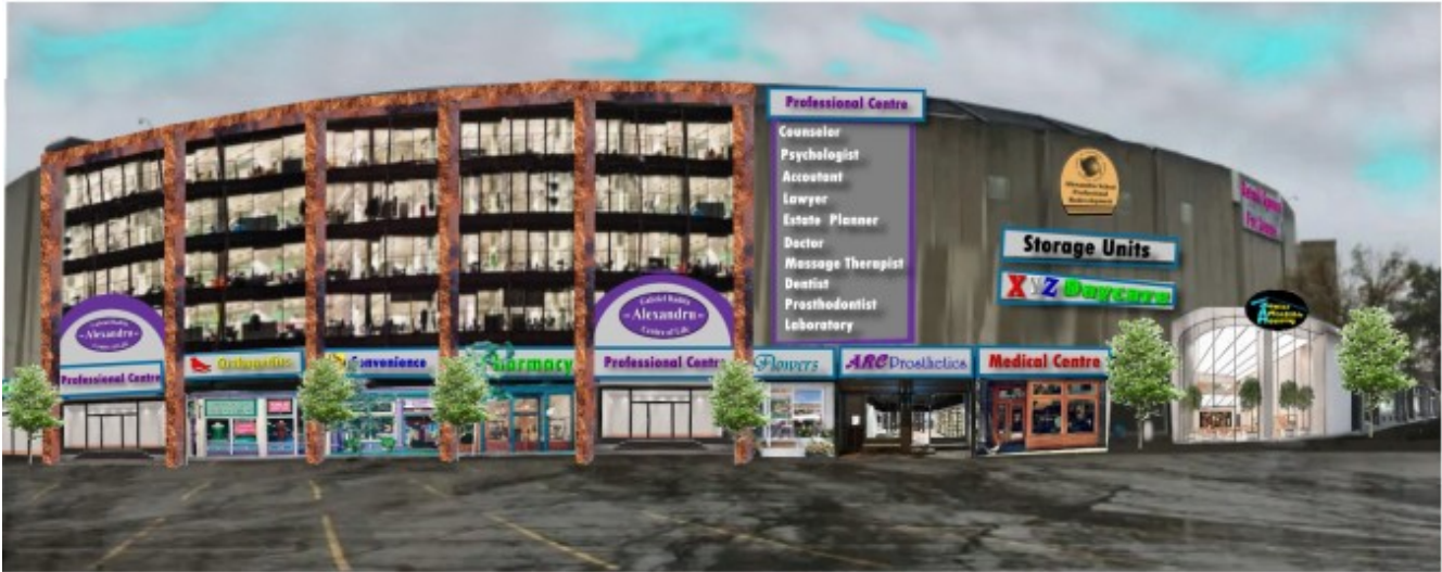
Figure 5: Proposed changes from 75th Street entrance NE view